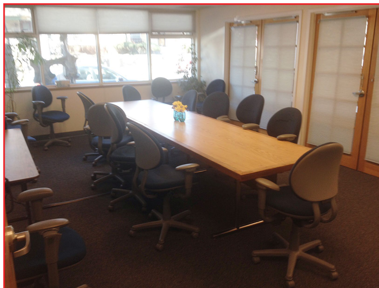
BUILDING COMMON CONFERENCE ROOM