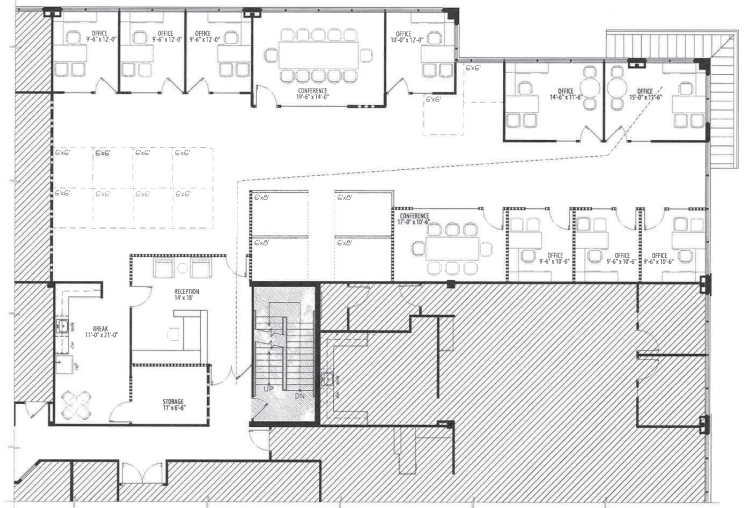
SUITE 260 5,102 RSF