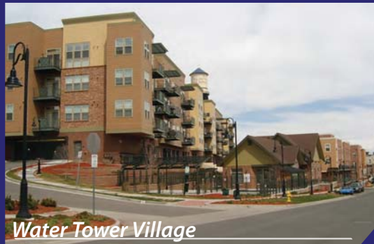
Water Tower Village

Landlord and Tenant Representation with Personal Service and Quality Results